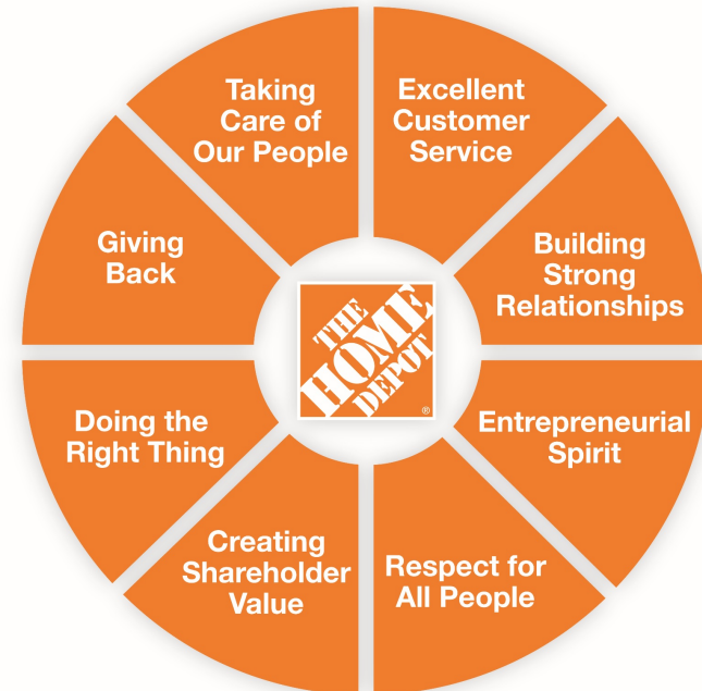
The Home Depot Values Wheel